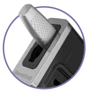
LARGE HANDLE Insert into upper sharpening slot (Chef and Santoku Knives)