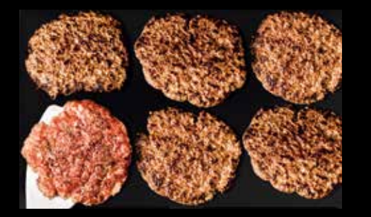
Larger cooking capacity for family-sized meals*