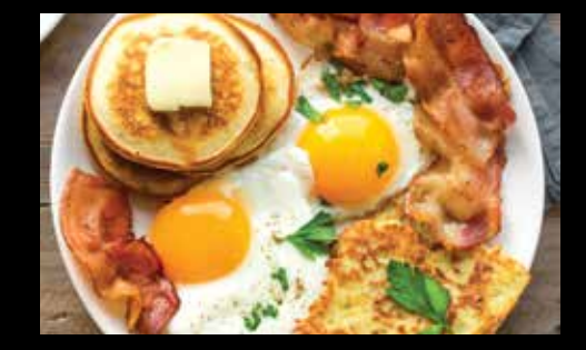
Even edge-to-edge heating