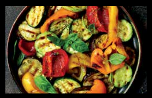
Hotter cooking with temps up to 500°F*