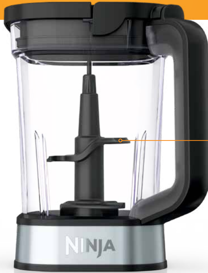
Dough Blade Assembly

To create ideal proofing conditions, heat oven to 170°F. Place dough ball in a greased oven-safe bowl and cover loosely with plastic wrap. Once the oven has reached temperature, turn the oven off and place the bowl in the oven. Allow to proof in the residual heat until dough has doubled in size.