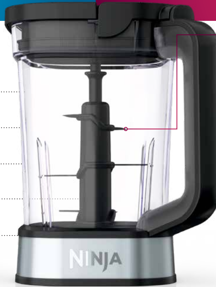
Total Crushing® and Chopping Blade Assembly (Stacked Blade)