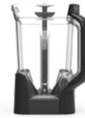
72 oz. Pitcher