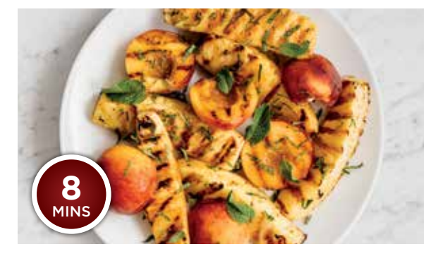
Pineapple & Peaches