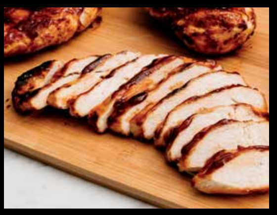
Frozen to char-grilled

No more falling apart Grilled Citrusy Halibut, page 29