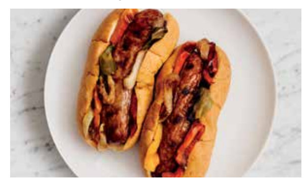
Sausage & Pepper Grinders Page 26

Best for bacon, sausages, and calzones, and when using thicker barbecue sauces.