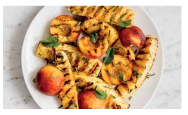
Pineapple & Peaches Page 44

Best for veggies, fruit, fresh and frozen seafood, and pizza.