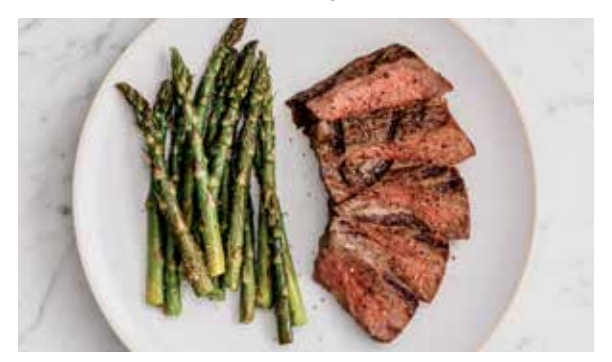
Grilled New York Strip Steak & Asparagus Page 12