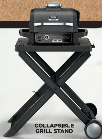
COLLAPSIBLE GRILL STAND

Getting the right stuff makes all the difference. Gear up with accessories for your new grill on NinjaKitchen.com/Accessories .