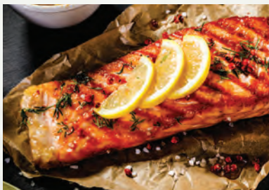
Top-down heat for a quick crisp