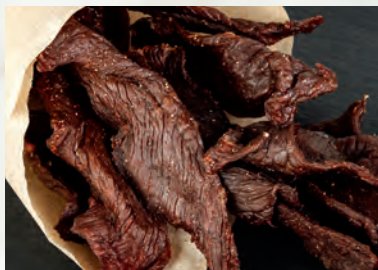
Dehydrated fruit or jerky