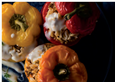
Roasted meats and veggies