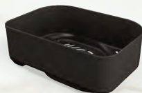
COMBO CRISPER BASKET