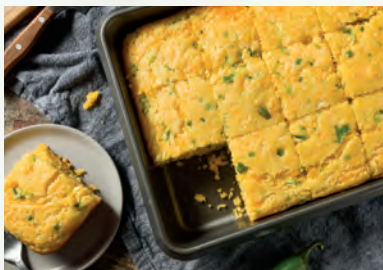
Cornbread, biscuits, and desserts